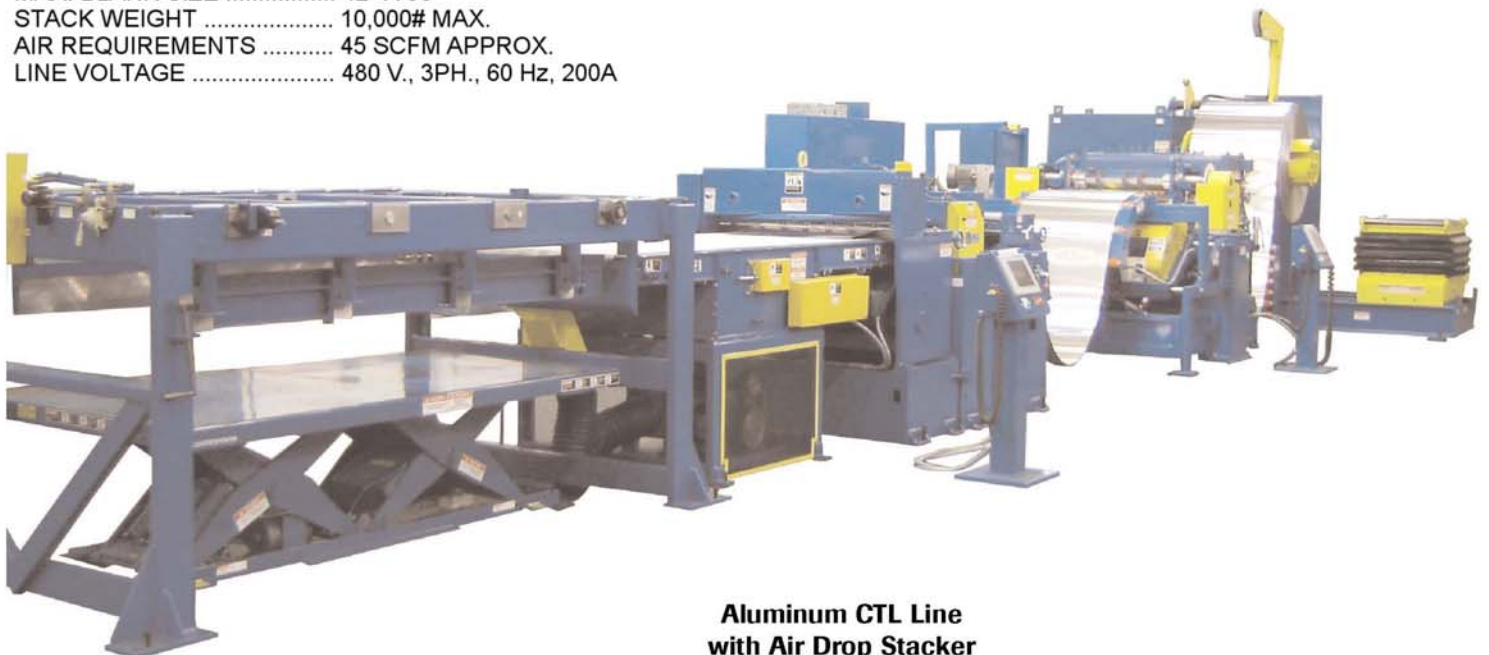
Aluminum CTL Line with Air Drop Stacker